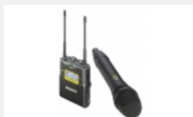
UWP-D12 UWP-D wireless microphone package with handheld transmitter