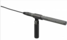
ECM-673 Short Shotgun Electret Condenser Microphone.