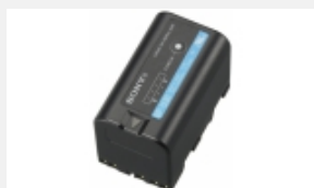
BP-U30 Lithium-ion Battery