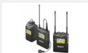
UWP-D16 Belt-pack UWP-D wireless microphone package with XLR plug-on transmitter