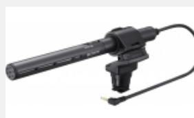
ECM-CG50BP Super-cardioid shotgun Electret condenser microphone