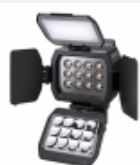
HVL-LBPC LED battery video light