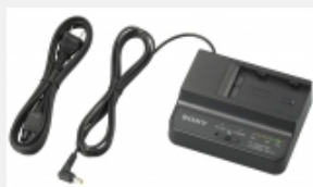
BC-U1 Battery charger/AC adaptor for BP-U90/U60/U30 Lithium-ion battery