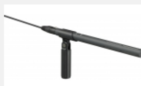
ECM-674 Affordable shotgun Electret condenser microphone