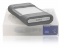
PSZ-HA1T 1TB Hard Disc Drive