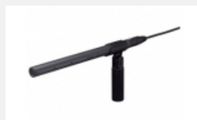
ECM-678 Shotgun Electret condenser microphone