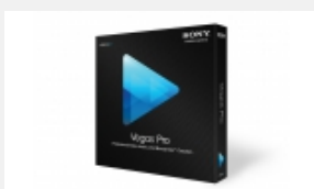
Vegas Pro 12 Professional Video, Audio, and Blu-ray Disc™ Creation