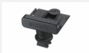
SMAD-P3 Multi Interface Shoe (MI Shoe) adaptor for cable-free connection