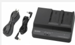
BC-U2 Two-channel simultaneous battery charger/AC adaptor for BP-U90/U60/U30 Lithium-ion battery