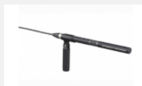
ECM-680S MS stereo shotgun Electret condenser microphone