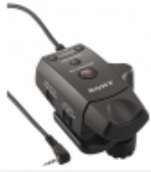
RM-1BP LANC Remote Commander