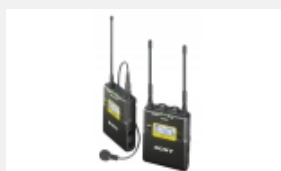
UWP-D11 Belt-pack UWP-D wireless microphone package