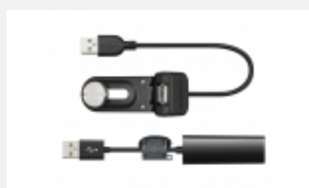
CBK-NA1 3G/4G/LTE and Wi-Fi network adapter kit for XDCAM camcorders