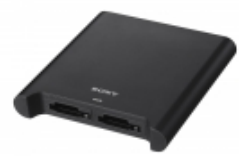
SBAC-UT100 Dual slots SxS PRO+ and SxS-1 solid state memory Thunderbolt 2 and USB 3.0 reader/writer