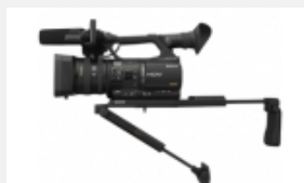
VCT-SP2BP Multi-function Camcorder Shoulder Support