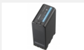
BP-U90 Lithium-ion battery (85 Wh)