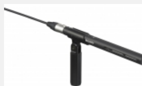
ECM-VG1 Shotgun Electret condenser microphone