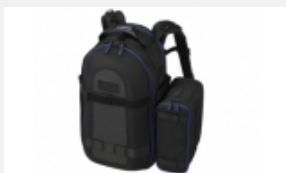
LCS-BP1BP Soft Backpack Style Carrying Case