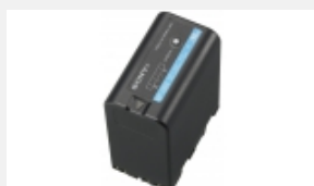
BP-U60 Lithium-ion Battery