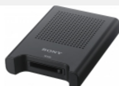
SBAC-US30 SxS PRO+ and SxS-1 solid state memory USB 3.0 reader/writer