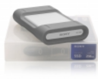
PSZ-SA25 256GB Solid State Drive