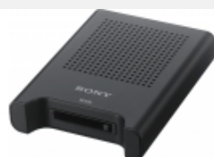
SBAC-US20 SxS PRO solid state memory USB 3.0 & 2.0 reader/writer